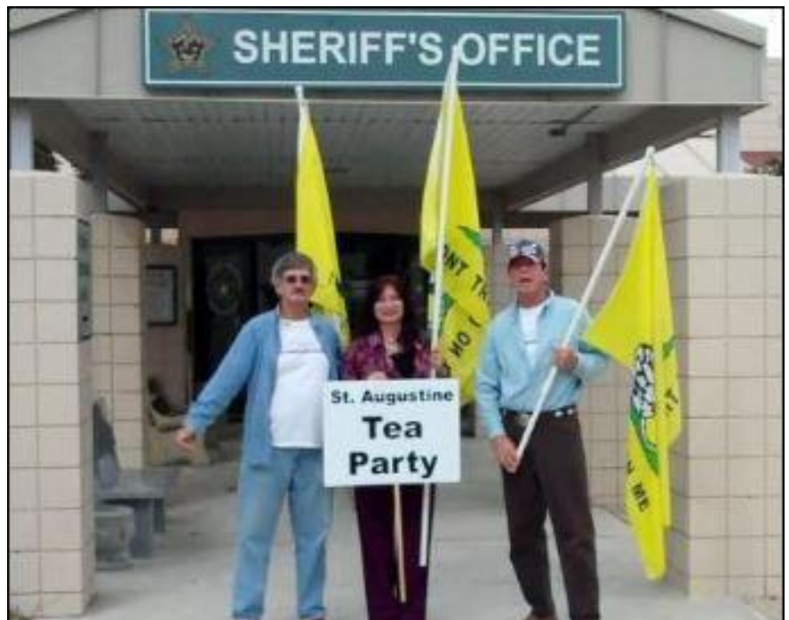
Jan 9, 2012

Apparently political parties are now part of the establishment. In 2010, the Sheriff’s Department would defend public officials. Political parties had to hire off-duty deputies and police officers for security. The Tea Party would let it be known that it was going to demonstrate at the REC and, like clockwork; they would spend money on security. I think that the Republicans are really insecure and particularly fearful of the people and the mainstream media. This fear has only increased since the beginning of the “We the People Movement” because in their hearts they know that their purpose in the political arena ended years ago.