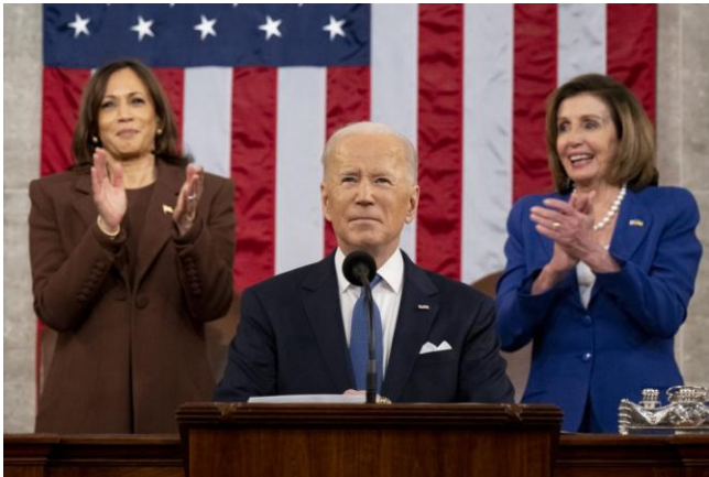
Screen Shot TCCR Staff "cake" moment.