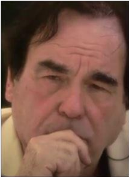
Internet Screenshot Oliver Stone

governments. Today we have the Internet, as an alternative underground news source. Totalitarian sympathizers jam the Internet like radio was jammed in the past; only they use a different technology. There are reporters, freelance and otherwise, who are dedicated to the distribution of the truth.