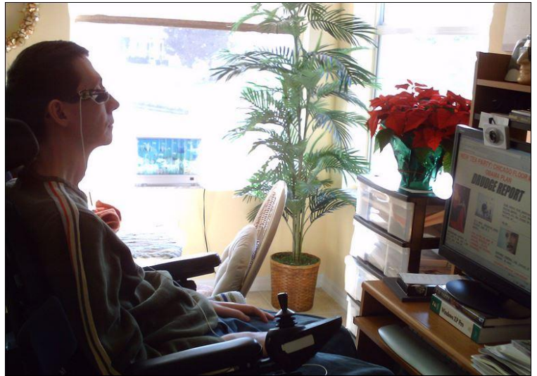
TCCR Staff Photo

the 1920's, are closing in with their final assault. What was once covert is now out in the open for anyone who looks to see. We are no longer a free people. We do as we are told. "Equal Justice Under the Law" is not understood by most Americans today. Our government no longer serves "We the People". Our leaders do not represent our will; instead, they rule.