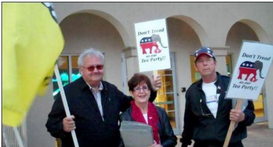
Staff Photos Feb 9, 2012 outside REC Meeting