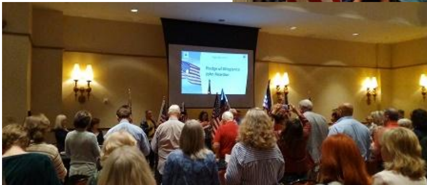
TCCR Staff Photos you

I must say that I was surprised to find myself in attendance. For months now, Grassroots Patriots from the St. Augustine Tea Party (SATP) and the North Florida