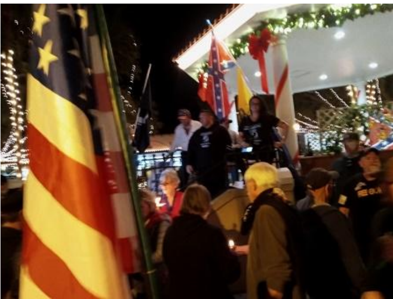
TCCR Staff Photo