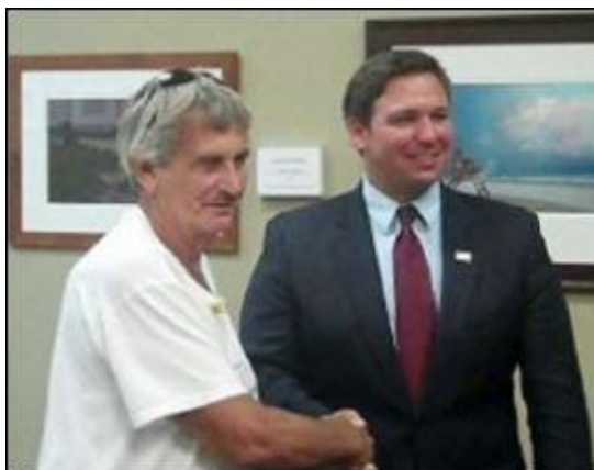
St Augustine 8-21-14

The 45 th President of the United States blew new life into the party, his presence enriched their coffers. And yet on January 20, 2021, all of the Washington Establishment in DC rejected the concept of America first and returned to the New World Order orthodoxy. God help us.