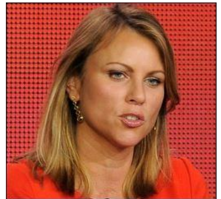
Internet Screenshot Lara Logan

Lara Logan, a Fox New contributor, is reporting on various Internet sites, that Ukraine is a playground for the Globalists where they raise money, launder money, create bio weapons and get involved in backroom deals where politicians personally profit. It is a system of lies, distortions and dis-information. Logan challenges some of the biggest names in the US government as being complicit in this Globalist's enterprise. Family members of U.S. politicians are being appointed to board positions of Ukrainian Corporations. These include family members of the Biden's, the Clinton's, the Kerry's, the Pelosi's and the Romney's, for example. The cesspool of the "Ukraine Swamp" creates a horrible situation for the Ukrainian People, who are truly suffering.